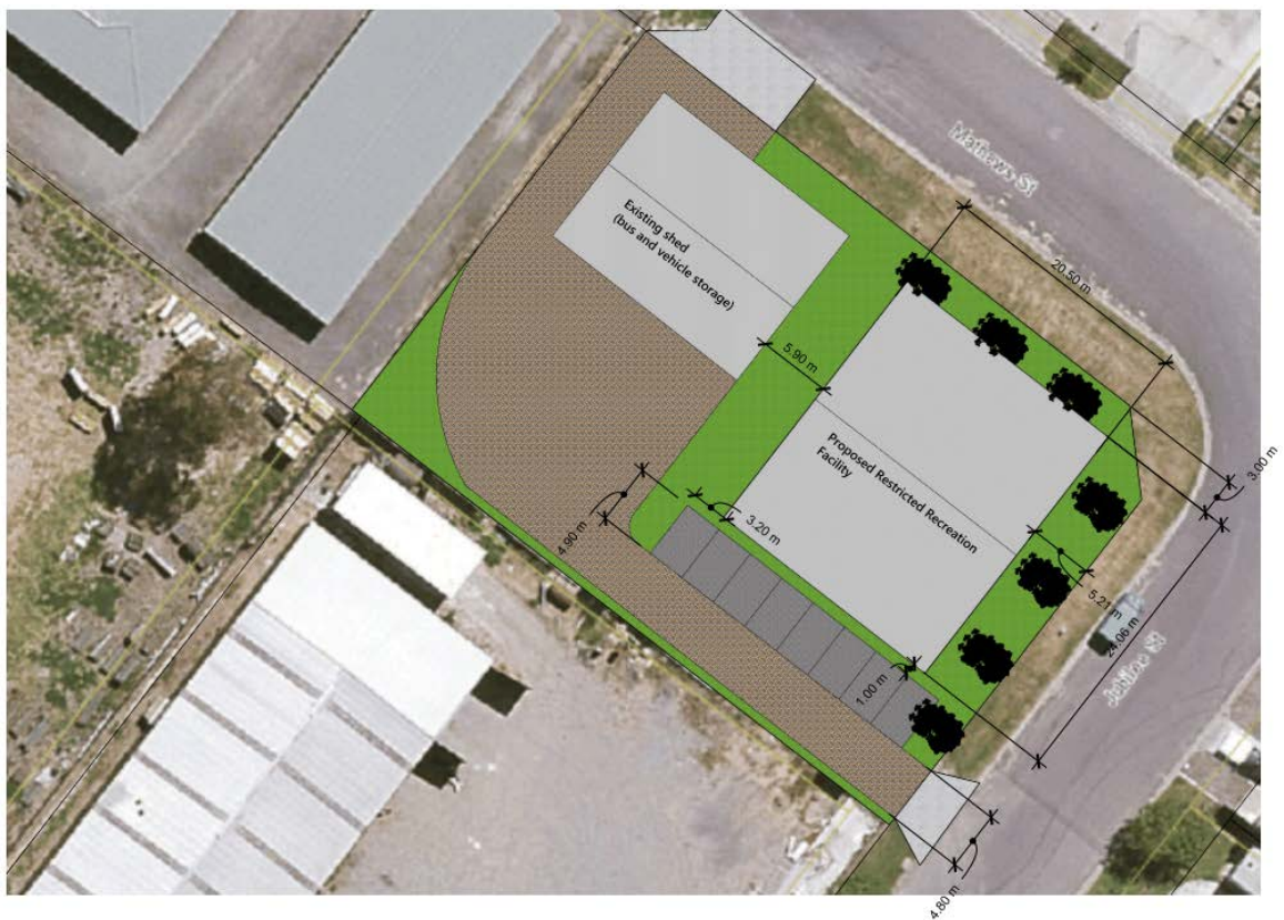
Figure 1: Shows the development layout on site.

The images below show the proposed site layout of the building: