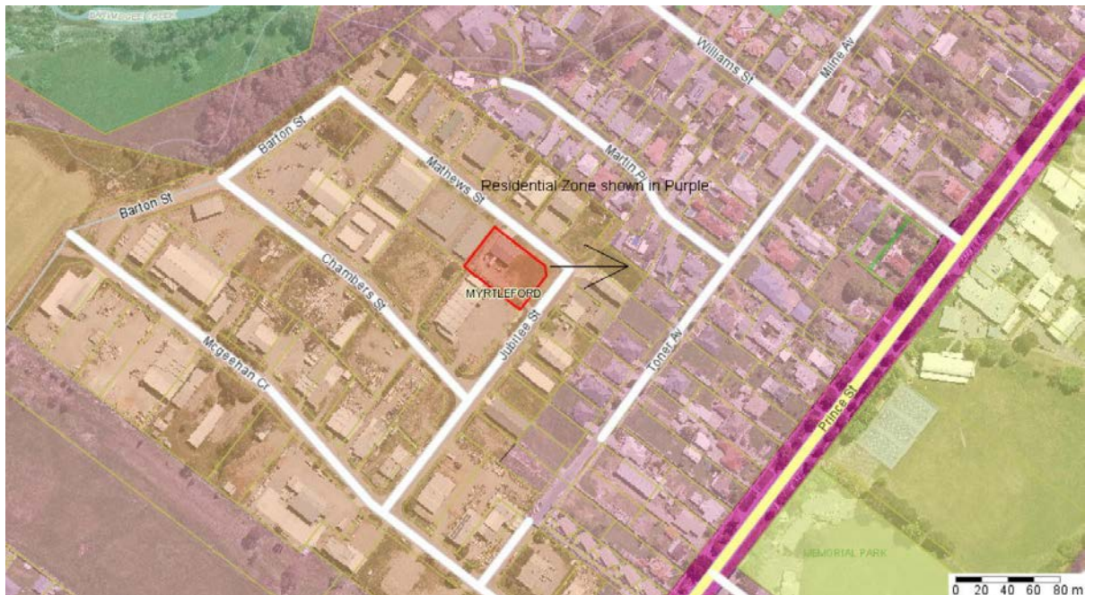
Figure 2: Subject land.

The subject site is located within the Industrial Estate of Myrtleford. The site is located in the North-Eastern pocket of the estate locating it some 50-60m away from the nearest residential housing to the East and South-East. The site is located on a corner and has dual access from Jubilee Street and Mathews Street. The site is also occupied by an existing Industrial warehouse used for the purpose of bus and vehicle storage. Figure 2 below shows the context of the site, and demonstrates the proximity of the land in relation to the residential areas close by.