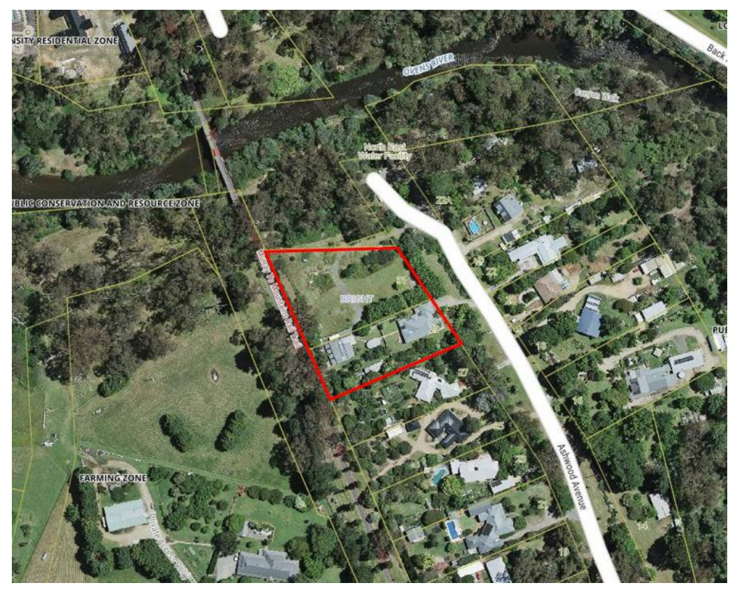
Figure 5: Aerial Image of the Subject Site