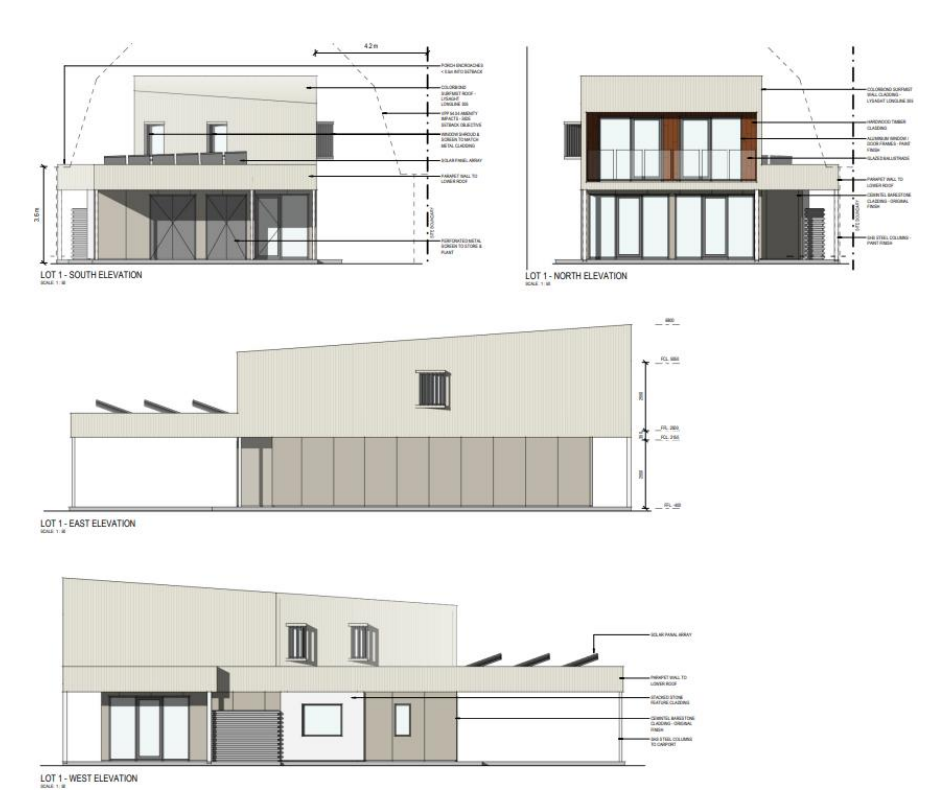
Figure 4: Elevation (Dwelling One)