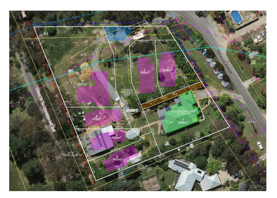
Figure 2: Plan of Subdivision