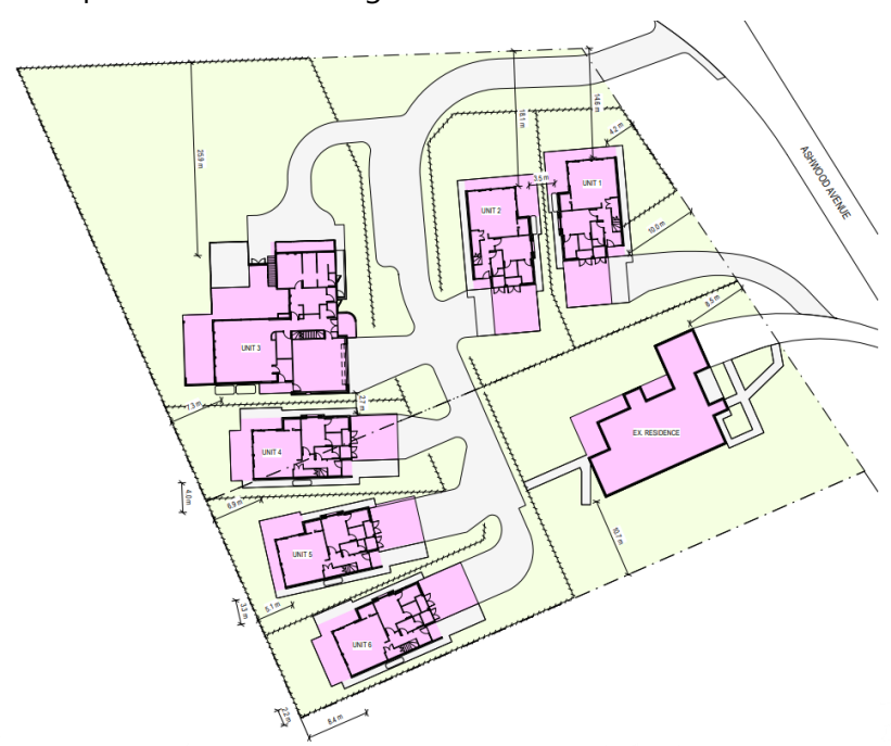
Figure 1: Site Plan

The proposal involves a seven lot subdivision with common property and the development of six dwellings.