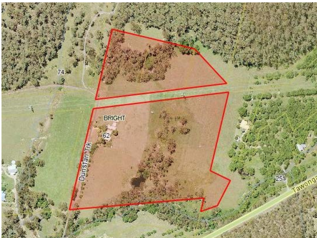
Figure 3: Subject land