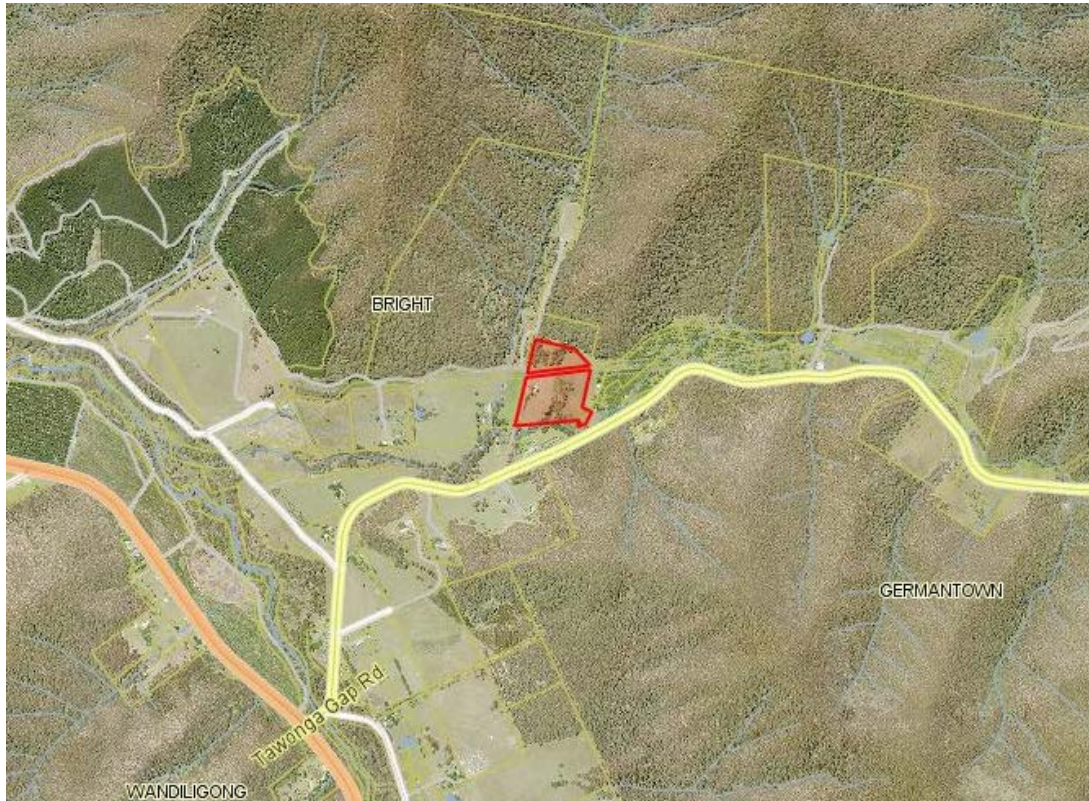
Figure 4: Subject land and surrounding context