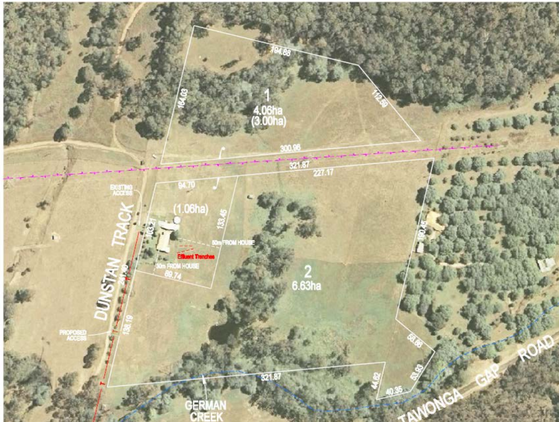
Figure 1: Proposed re-subdivision

It is proposed to re-subdivide five existing lots to create two lots. Proposed Lot 1 would have an area of 4.06 hectares and would be separated into two parcels via an unmade government road. It would contain the existing dwelling. Proposed Lot 2 would be 6.63 hectares and would consolidate the remainder of the site. The proposal is depicted in Figure 1 below.