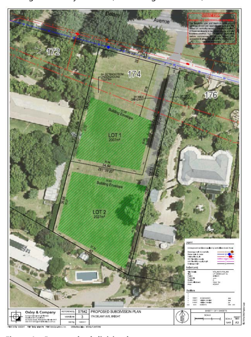
Figure 1: Proposed subdivision layout

The proposal is to subdivide a vacant low density residential lot into two lots of 2007m² and 2027m² respectively. Lot 1 will have road frontage to Delany Avenue of 40 metres. Lot 2 will be accessed via a battle-axe configuration with a 5 metre road frontage to Delany Avenue (refer to Figure 1 below).