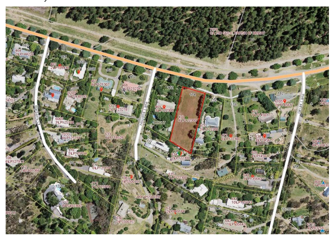
Figure 2: Subject land.