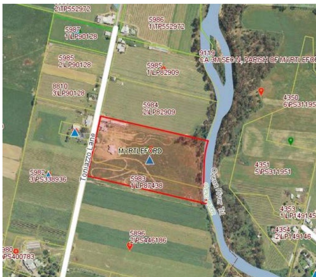
Figure 1: Subject Land