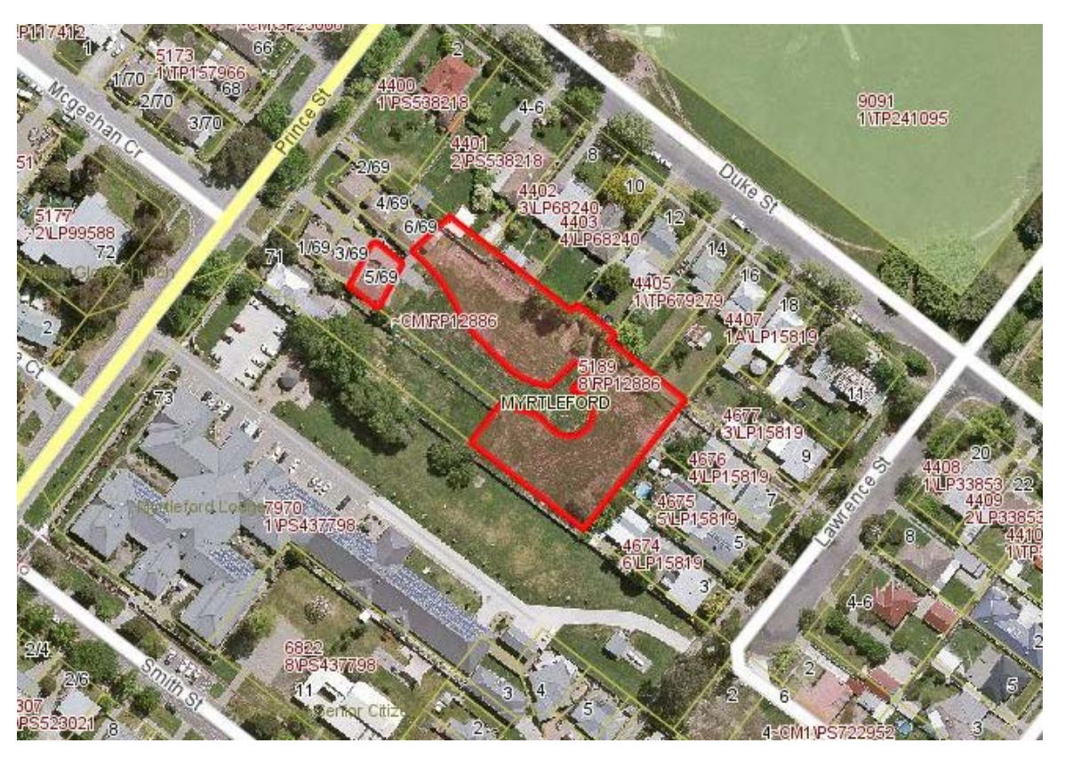
Figure 4: Subject land.