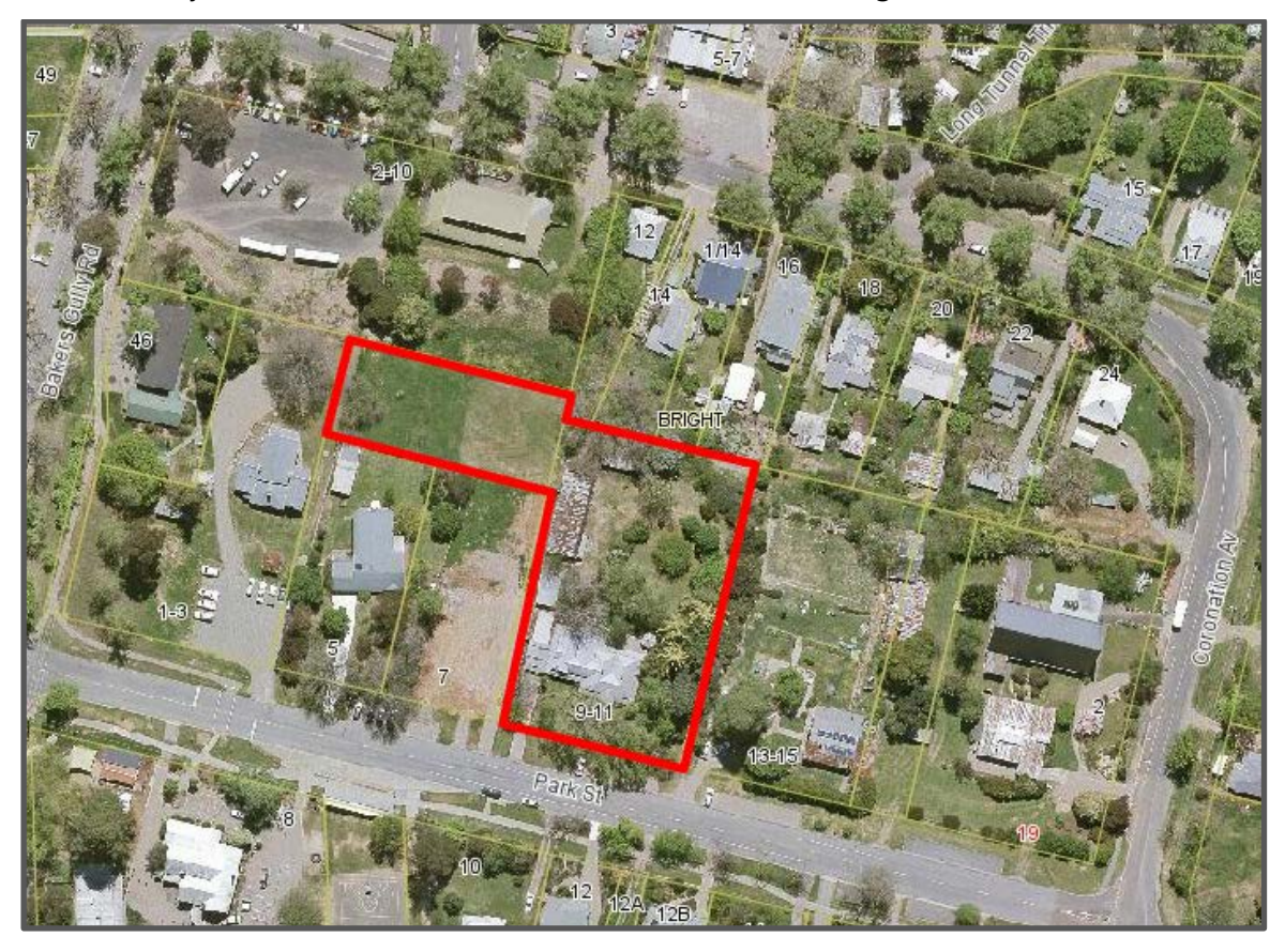
Figure 2: Subject land and surrounds.

The centre of the subject land is located 180m from the southern end of Bright commercially zoned business district and is shown below in Figure 2.