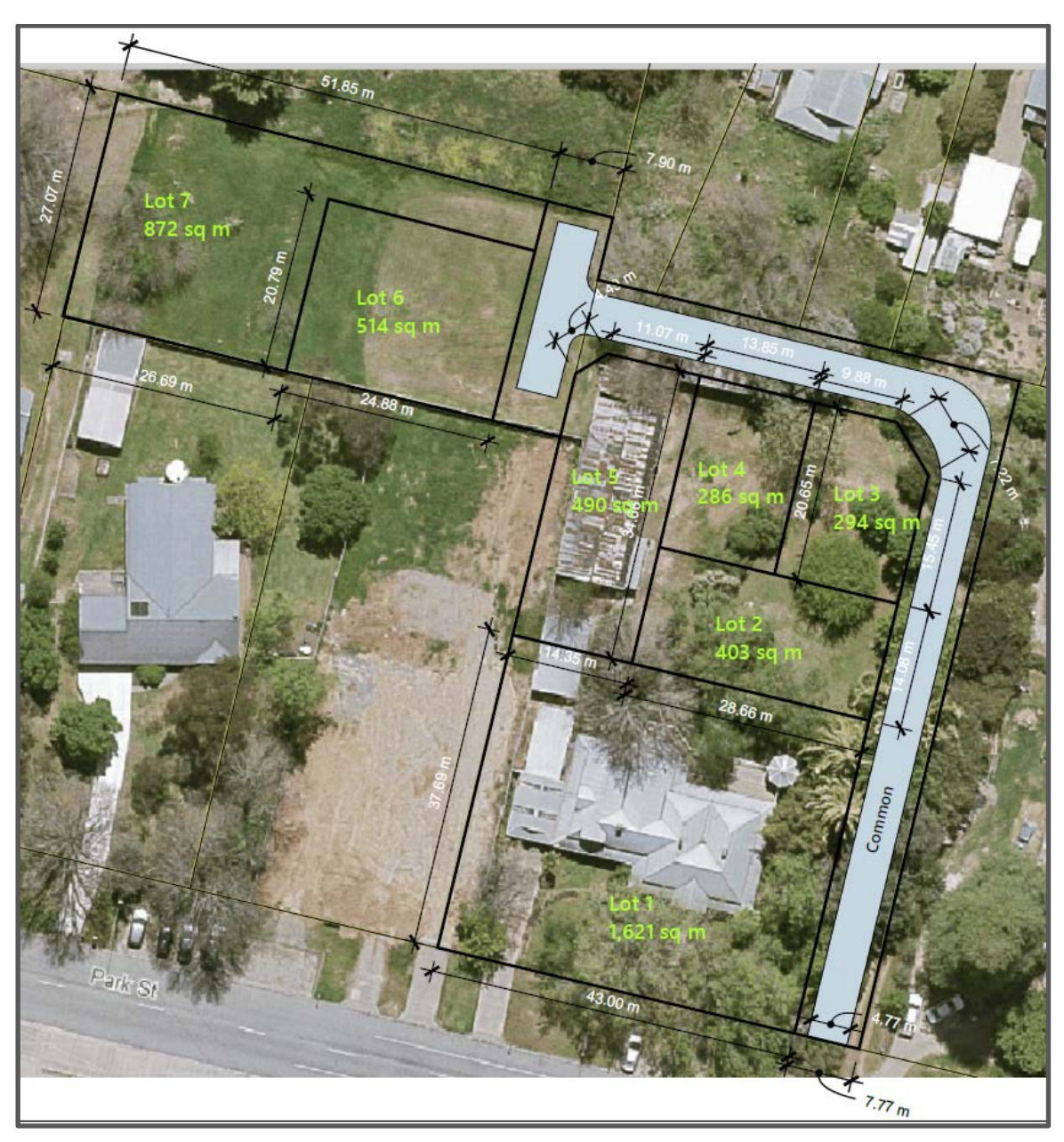
Figure 1: Shows the development layout on site.