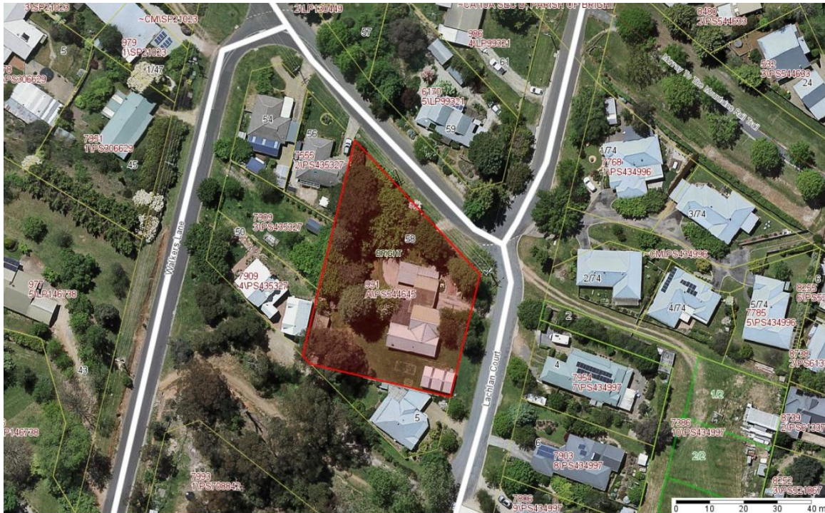
Figure 2: Subject land.

There are street trees in the verge abutting the site and a constructed kerb and channel in the Walkers Lane verge abutting the site. Some stormwater infrastructure exists in the Lachlan Court verge abutting the site.