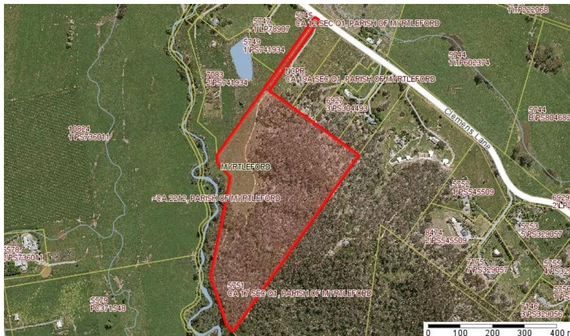
Figure 2: Subject land.

Buffalo Creek abuts the site the rear and there is native vegetation along this creek.