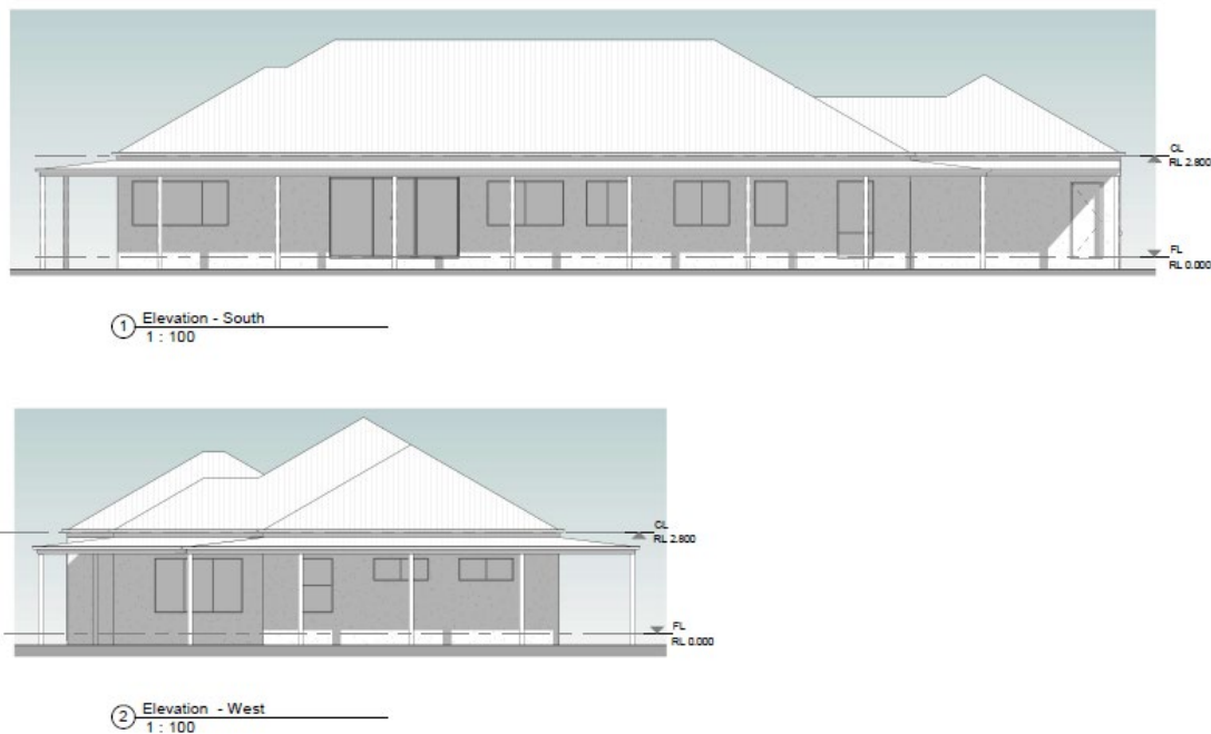
Figure 1: Shows the development layout on site.