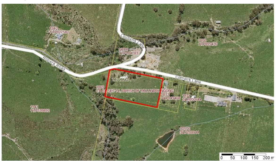
Figure 2: Subject land.

There are four (4) large (over 40 hectares) open farmland sites, within close proximity (500 metres) of the site, of which two (2) directly abut the subject site, and three (3) smaller sites within close proximity (500 metres) of the site, of which two (2) have a dwelling.