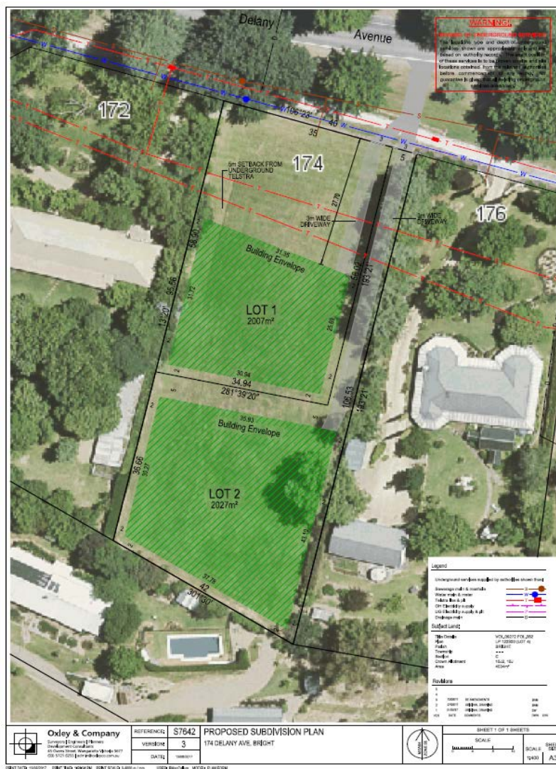
Figure 1: Proposed subdivision layout

The proposal is to subdivide a vacant low density residential lot into two lots of 2007m 2 and 2027m 2 respectively. Lot 1 will have road frontage to Delany Avenue of 40 metres. Lot 2 will be accessed via a battle-axe configuration with a 5 metre road frontage to Delany Avenue (refer to Figure 1 below).