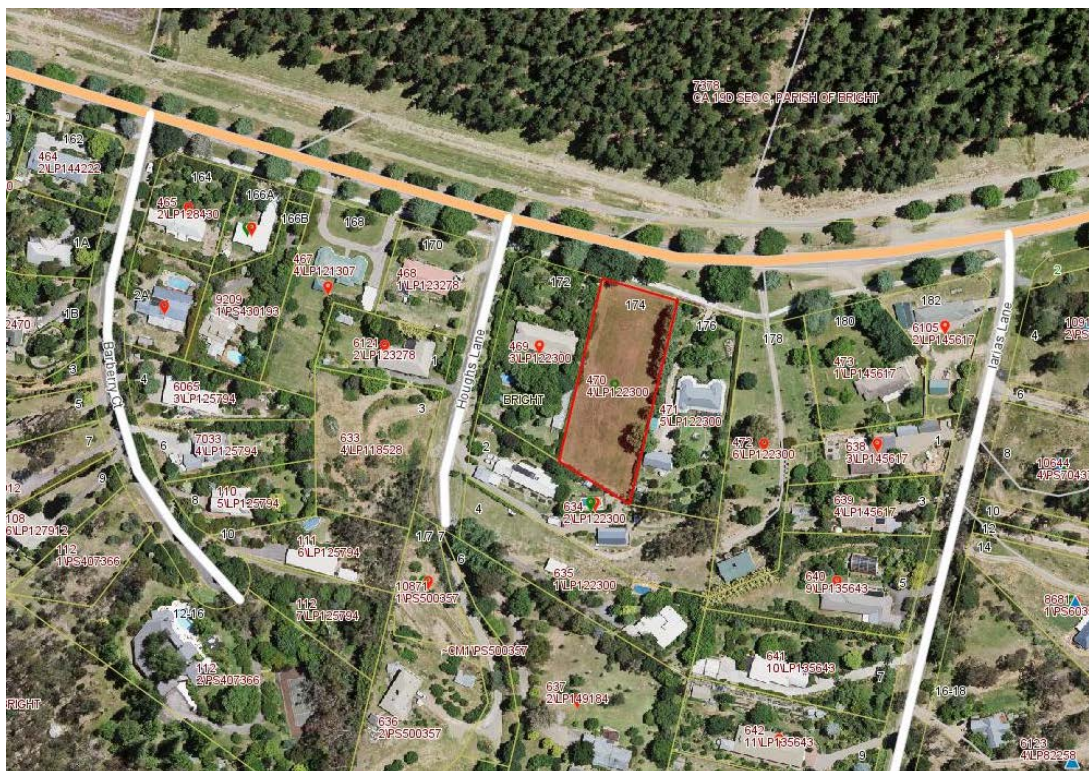
Figure 2: Subject land.